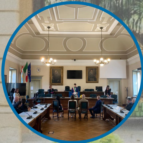
SALA DEL CONSIGLIO COMUNALE PALAZZO BOVARA