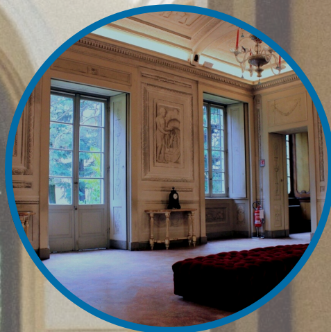
SALA DELLE GRISAGLIE VILLA MANZONI