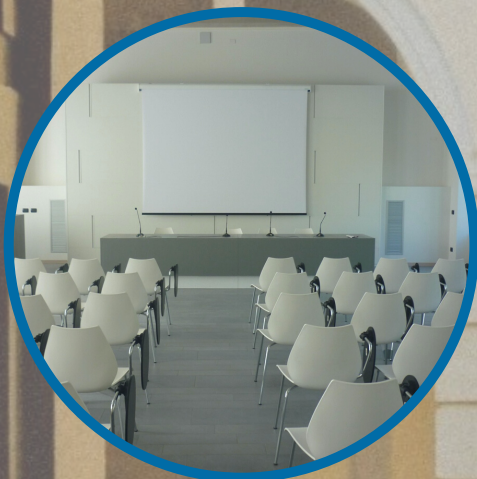
SALA CONFERENZE PALAZZO DELLE PAURE