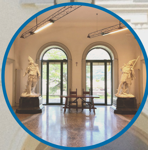
SALA BRASILIA VILLA GOMES